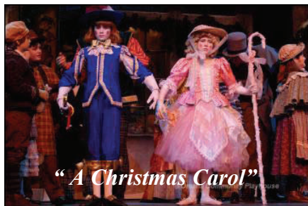
"A Christmas Carol"