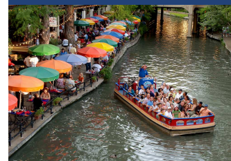
Relax on a cruise at the famous River Walk