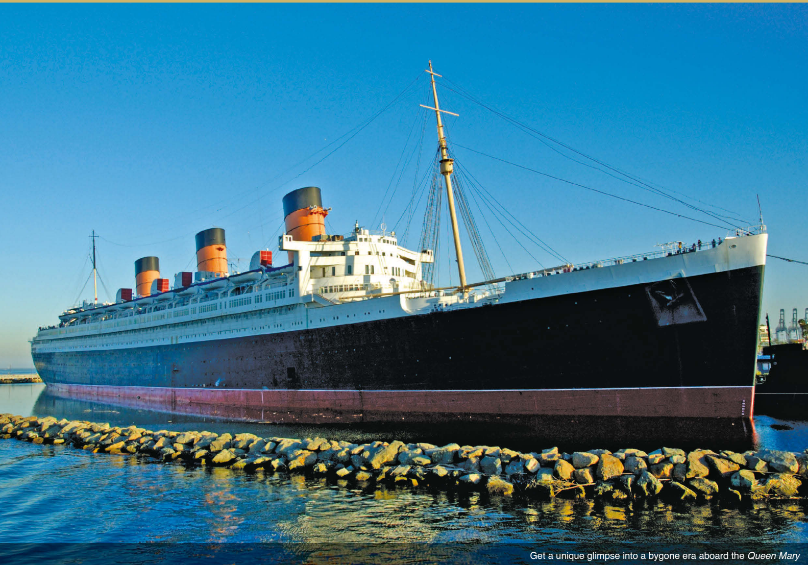
Get a unique glimpse into a bygone era aboard the Queen Mary