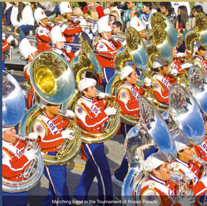
Marching band in the Tournament of Roses Parade