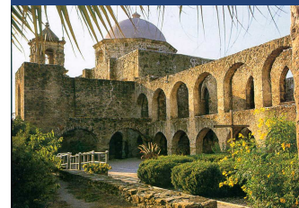
Mission San Jose is one of America's great landmarks