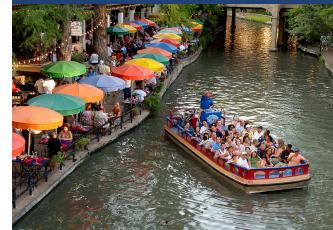
Relax on a cruise at the famous River Walk