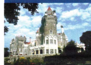
Magnificent Casa Loma Castle in Toronto