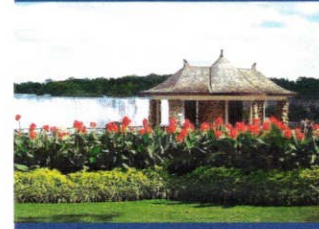
Visit beautiful Queen Victoria Park

$75 Due Upon Signing. *Price per person, based on double occupancy. Add $299 for single occupancy. Final Payment Due: 2/28/2020