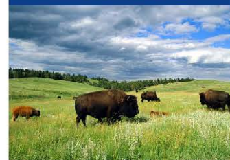
Wildlife enhances the pristine Black Hills

$75 Due Upon Signing. *Price per person, based on double occupancy. Add $285 for single occupancy. Final Payment Due: 4/16/2018