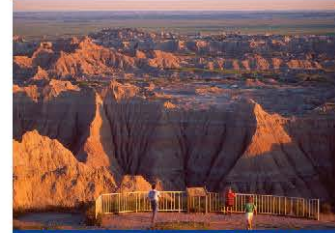
Spectacular Badlands National Park