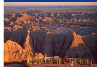
Spectacular Badlands National Park