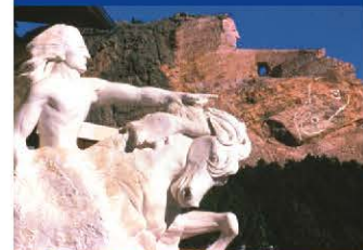
Crazy Horse Monument to be 10x the size of Mt. Rushmore