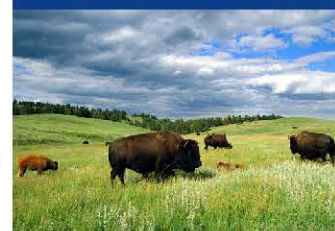
Wildlife enhances the pristine Black Hills

Departure: Topeka, KS @ 8 am, then Lawrence, KS, then Prairie Village, KS