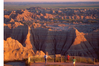
Spectacular Badlands National Park