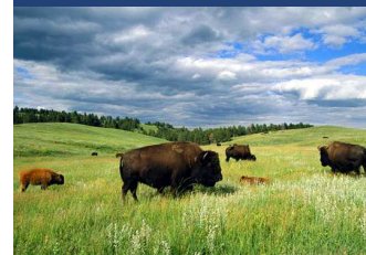
Wildlife enhances the pristine Black Hills