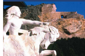
Crazy Horse Monument to be 10x the size of Mt. Rushmore