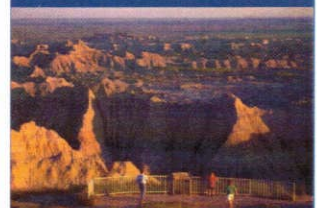
Spectacular Badlands National Park