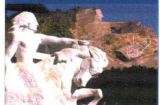
Crazy Horse Monument to be 10x the size of Mt. Rushmore