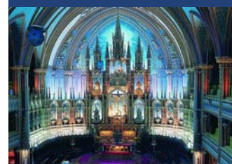
See the beautiful Notre Dame Basilica