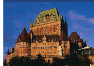
Enjoy a Guided Tour of Québec City

$75 Due Upon Signing. *Price per person, based on double occupancy. Add $355 for single occupancy.