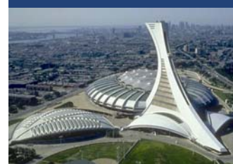
Visit Montréal's Olympic Park