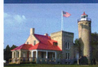
Mackinac Point Lighthouse