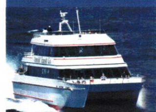
Mackinac Island Ferry

Departure: Topeka, KS @ 8 am, then Lawrence, KS @ 8:45 am then Kansas City, KS @ 9:30 am