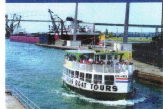
Soo Locks Cruise in Sault Sainte Marie