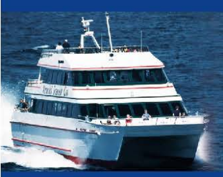
Mackinac Island Ferry