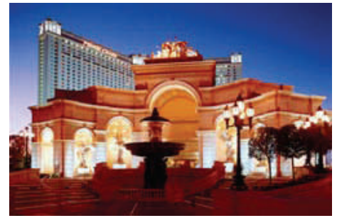
Monte Carlo Hotel & Casino

$949.00 per person, double occupancy (Lower than 2006 tour cost)