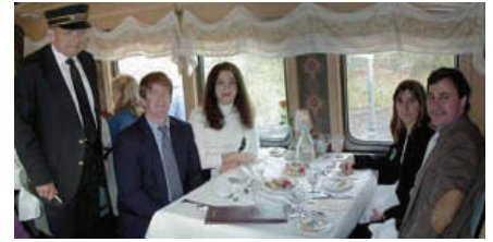
Cape Cod Dinner Train