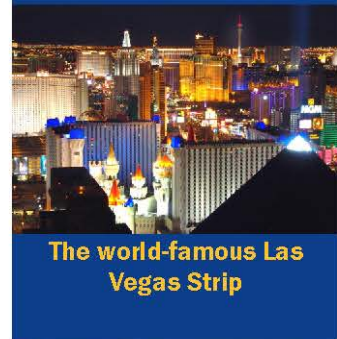
The world-famous Las Vegas Strip