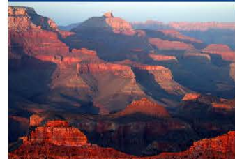
View the spectacular Grand Canyon