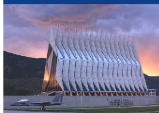
Visit to the U.S. Air Force Academy