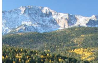
Famous Pikes Peak - America's Mountain