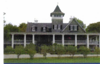
Tour Historic Magnolia Plantation

$75 Due Upon Signing. *Price per person, based on double occupancy. Add $420 for single occupancy.