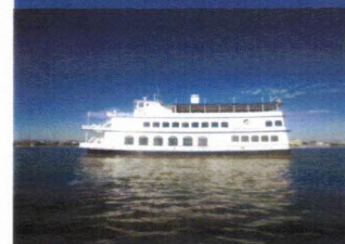
Cruise Around Charleston Harbor