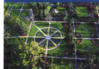
Visit Middleton Place and Gardens