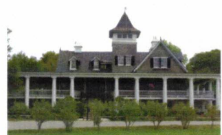
Tour Historic Magnolia Plantation

$75 Due Upon Signing. *Price per person, based on double occupancy. Add $420 for single occupancy.