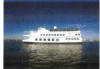
Cruise Around Charleston Harbor