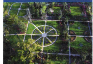
Visit Middleton Place and Gardens