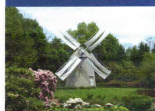
One of Cape Cod's many Windmills

$75 Due Upon Signing. *Price per person, based on double occupancy.