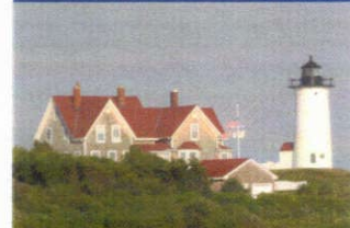
Lighthouse overlooking Vineyard Sound