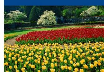
One of the Biltmore's many gardens.