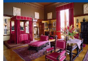
Grand Victorian architecture.