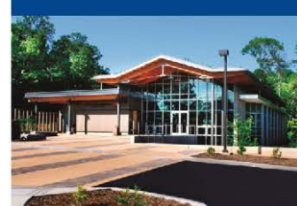
The Blue Ridge Parkway Visitor Center.