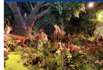
Visit to the Amazing Creation Museum!