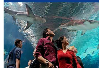
Incredible Creatures at Newport Aquarium

Departure: Topeka, KS @ 8 am, then Lawrence, KS @ 8:45 am, then Kansas City, KS @ 9:30 am