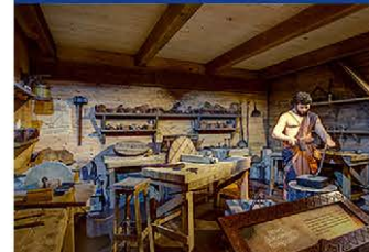
View from Inside the Ark Encounter