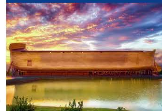
Enjoy a visit to the Famous Ark Encounter!